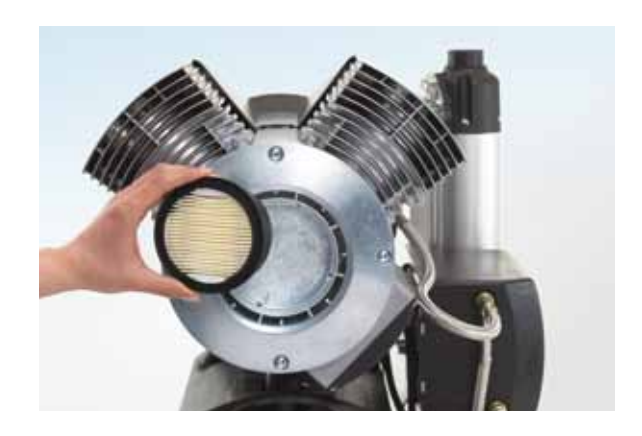
Easy replacement of intake filter