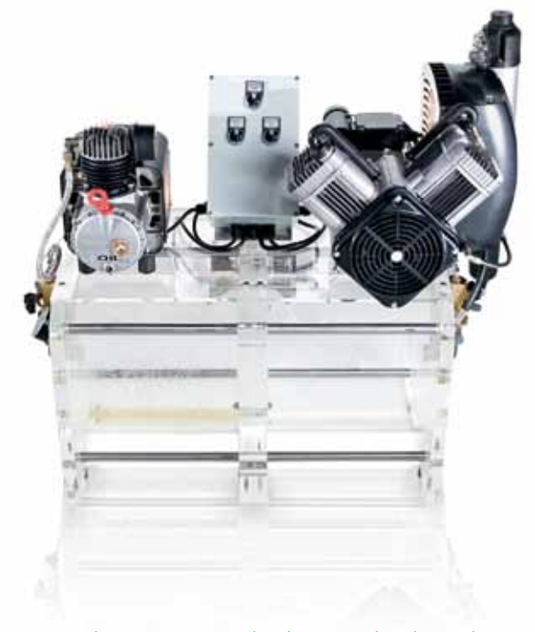
Air that is contaminated with water, oil and particles is not suitable for use in dental treatment!

The Tornado is one of the quietest compressors for dentistry on the market – yet it is extremely powerful. The aerodynamic ventilation fan hood around the compressor unit ensures really quiet running, thus improving the comfort of both dentist and patient.